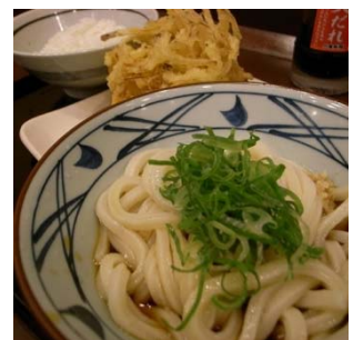
川越うどん "Kawagoe-Udon" A type of thick wheat flour noodle