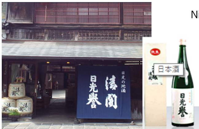
Nikko-Jizake (Sake) 日光地酒