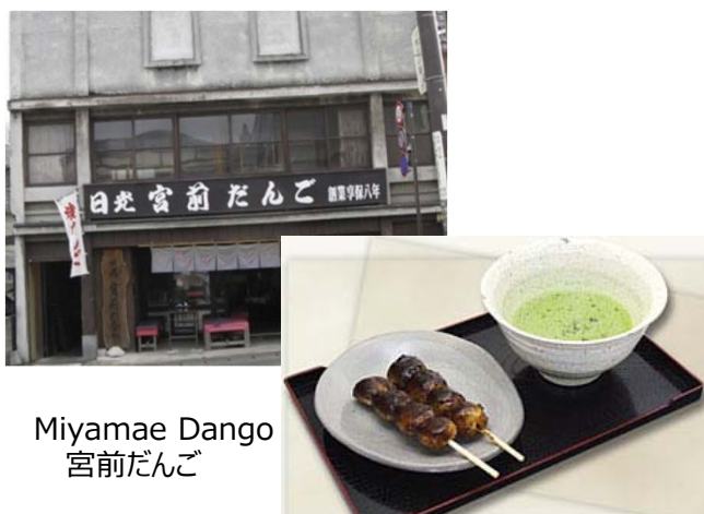
Miyamae Dango 宮前だんご

Yokan is a traditional Japanese sweet, which is basically made of azuki beans, kanten (agar agar), and sugar.