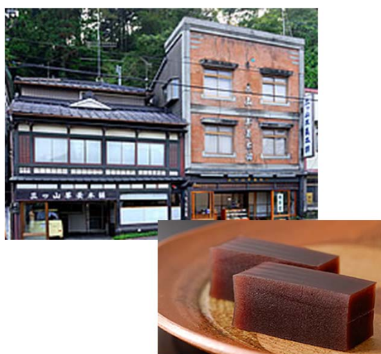
Nikko Neri-yokan 日光練羊羹

Yokan is a traditional Japanese sweet, which is basically made of azuki beans, kanten (agar agar), and sugar.