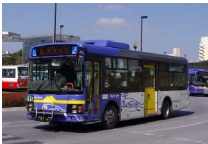
Hokubu Shuttle Bus