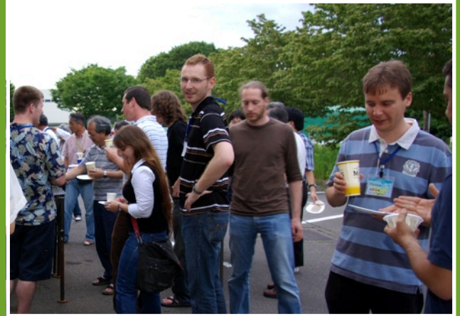
The participants line up for food during the party held on July 8 in KEKB Control Building. There were many participants from new member institutions.

luminosity of 2.11 \times 10^{34} \text{ cm}^{-2} \text{ s}^{-1} on June 17 this year, renewing own world record. Now KEKB is turned off for the summer when the electricity demand is high in Japan. It will start again this fall before the SuperKEKB-Belle II collaboration hopefully launch into the construction starting next year. The proposed upgrade will require a shutdown of three full years.