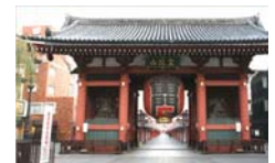
< Kaminari-mon >