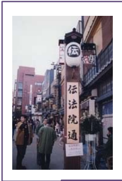
Decpo-in Dori 伝法院通り