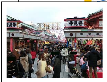
<Nakamise Dori 仲見世通り>

From Asakusa, there are two lines which are Sumida river line and Asakusa-Odaiba Direct line. It shows you the old bridges and the emotion of Edo. You can feel the changing of Tokyo