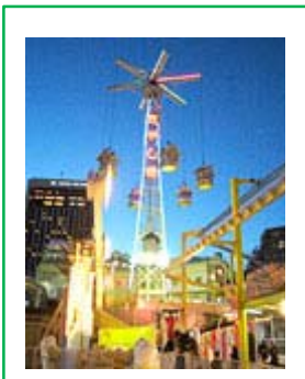
<Hanayashiki> Amusement Park

http://www.gotokyo.org/en/tourists/guideservice/guideservice/guide_3.html