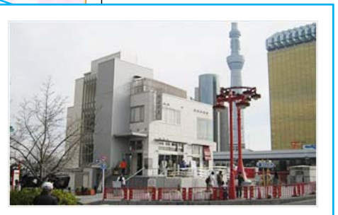
< Tokyo Cruise >