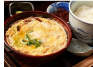
Hakone Yumoto Yuba-don

Hakone Free-pass is an economical way of touring Hakone. Offers unlimited boarding of transportation and discounts to various facilities in the Hakone area.