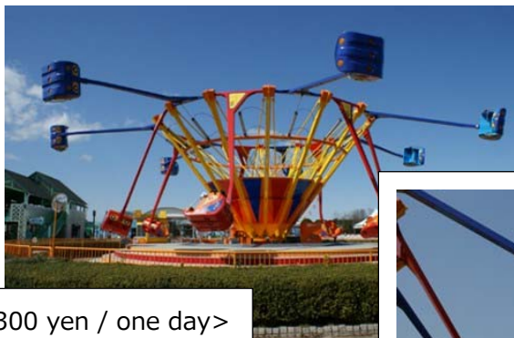
<300 yen / one day>