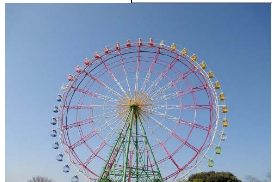
<600 yen / one ride>