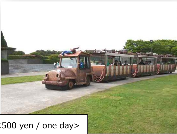
<500 yen / one day>

BBQ is allowed only in the designated area. Using the BBQ facility (incl. kitchen detergent, dolly to carry equipment, etc.) is free of charge, but must be reserved beforehand. Call 029-265-9002 or web https://secure.visitors.jp/hitachibbq/ for reservation. Application can be done from three months prior to and at least one week prior to the day of the BBQ. You bring charcoal, cooking utensils, food etc. Charcoal 3kg can be purchased at 500 yen