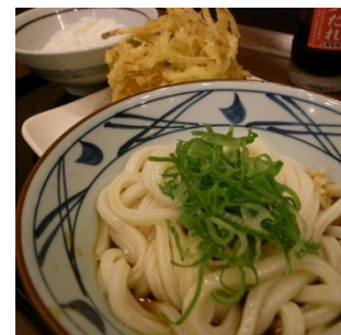
川越うどん “Udon” a type of thick wheat flour noodle of Japanese cuisine.